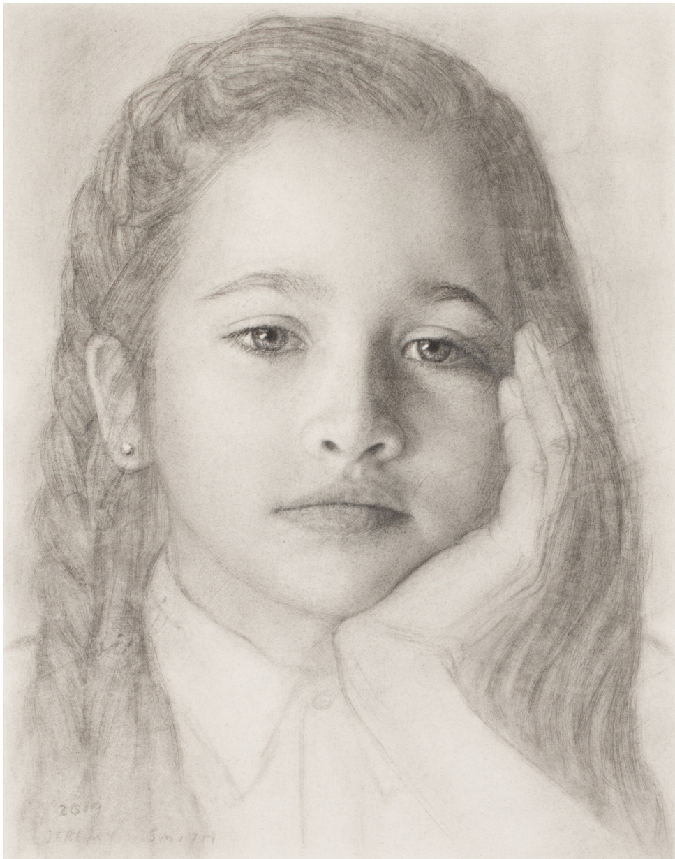
Emiko 2019 pencil on paper 11 7/8 x 9 1/4 inches