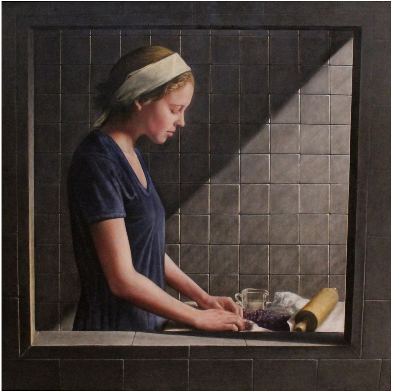
Pastry Chef 2016 egg tempera on masonite 23 3/4 x 23 3/4 inches