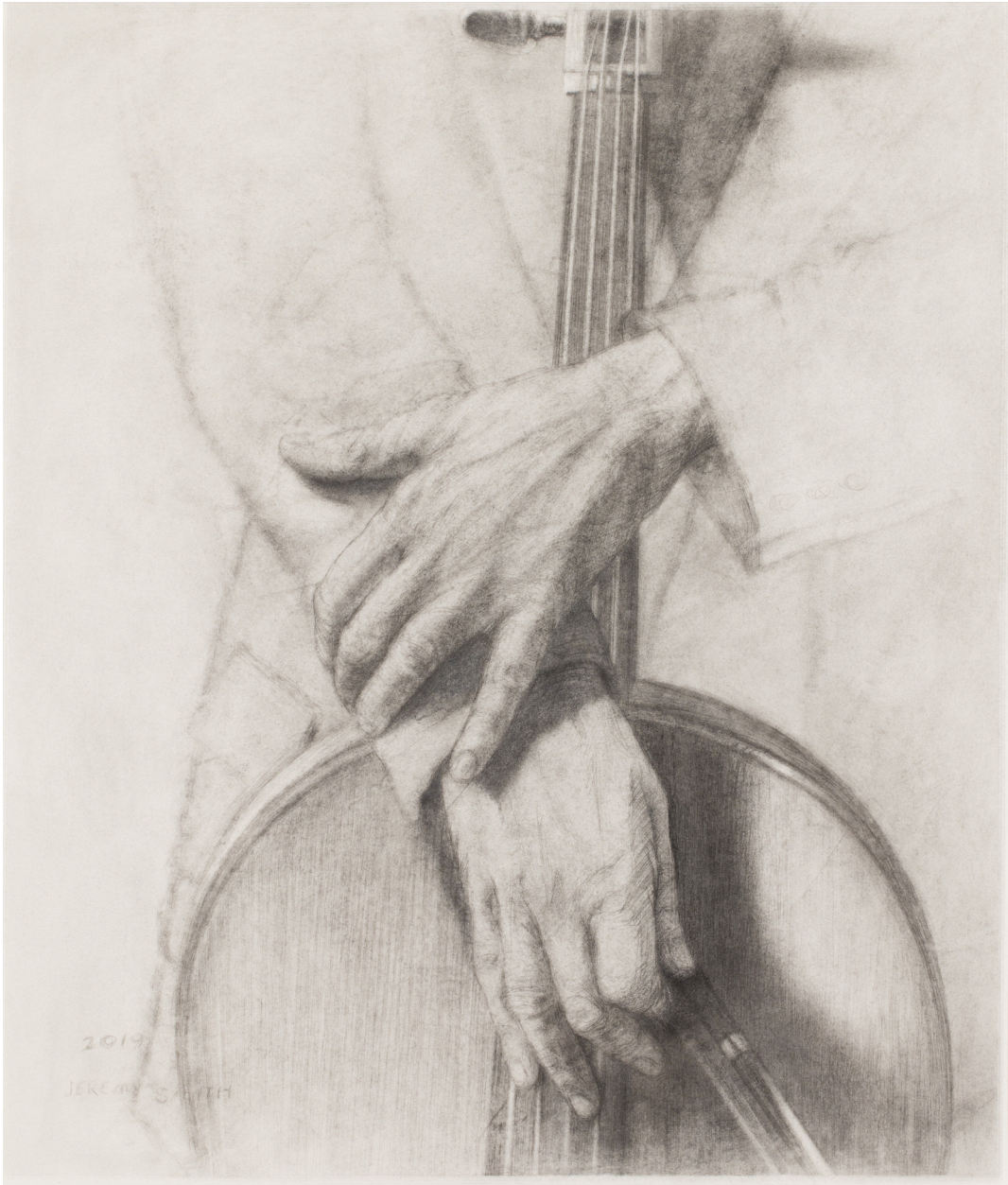
Hands of a Cellist 2019 pencil on paper 14 x 12 inches