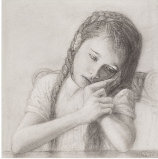
Emiko 2 2019 pencil on paper 14 1/2 x 14 1/2 inches