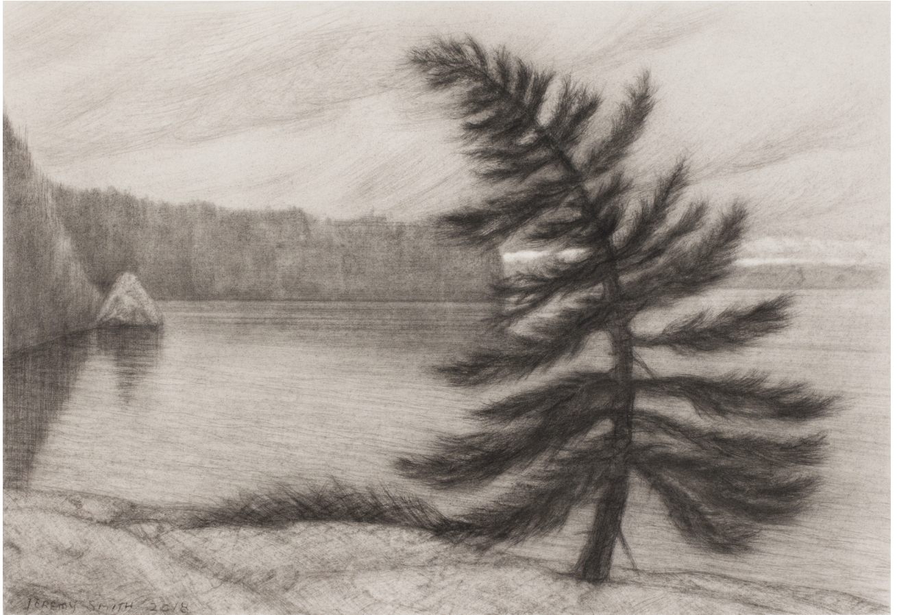
Toward Mosquito Bay 2018 pencil on paper 8 1/16 x 11 3/4 inches