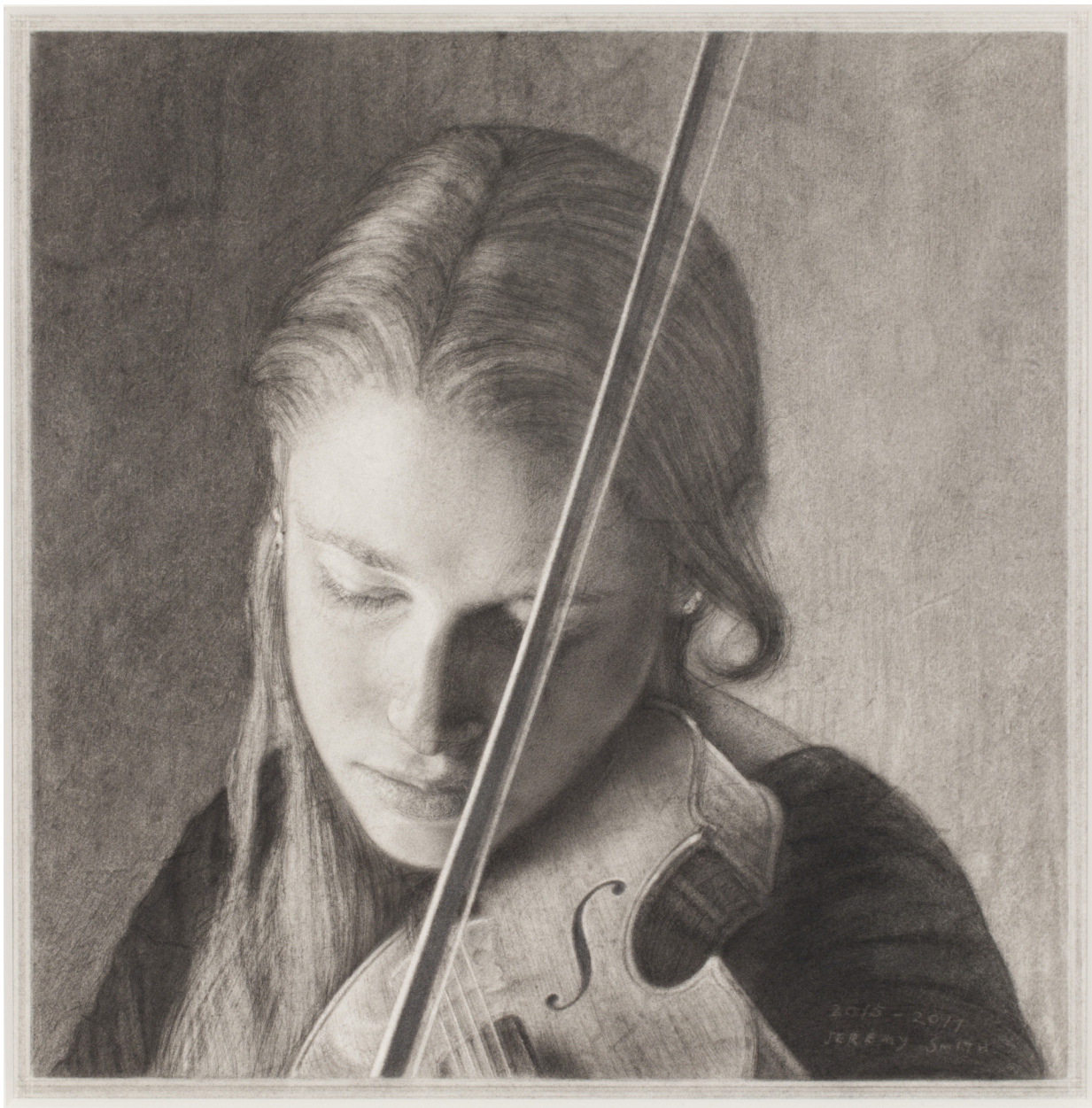
Girl with Violin 2015-2017 pencil on paper 13 7/8 x 13 7/8 inches