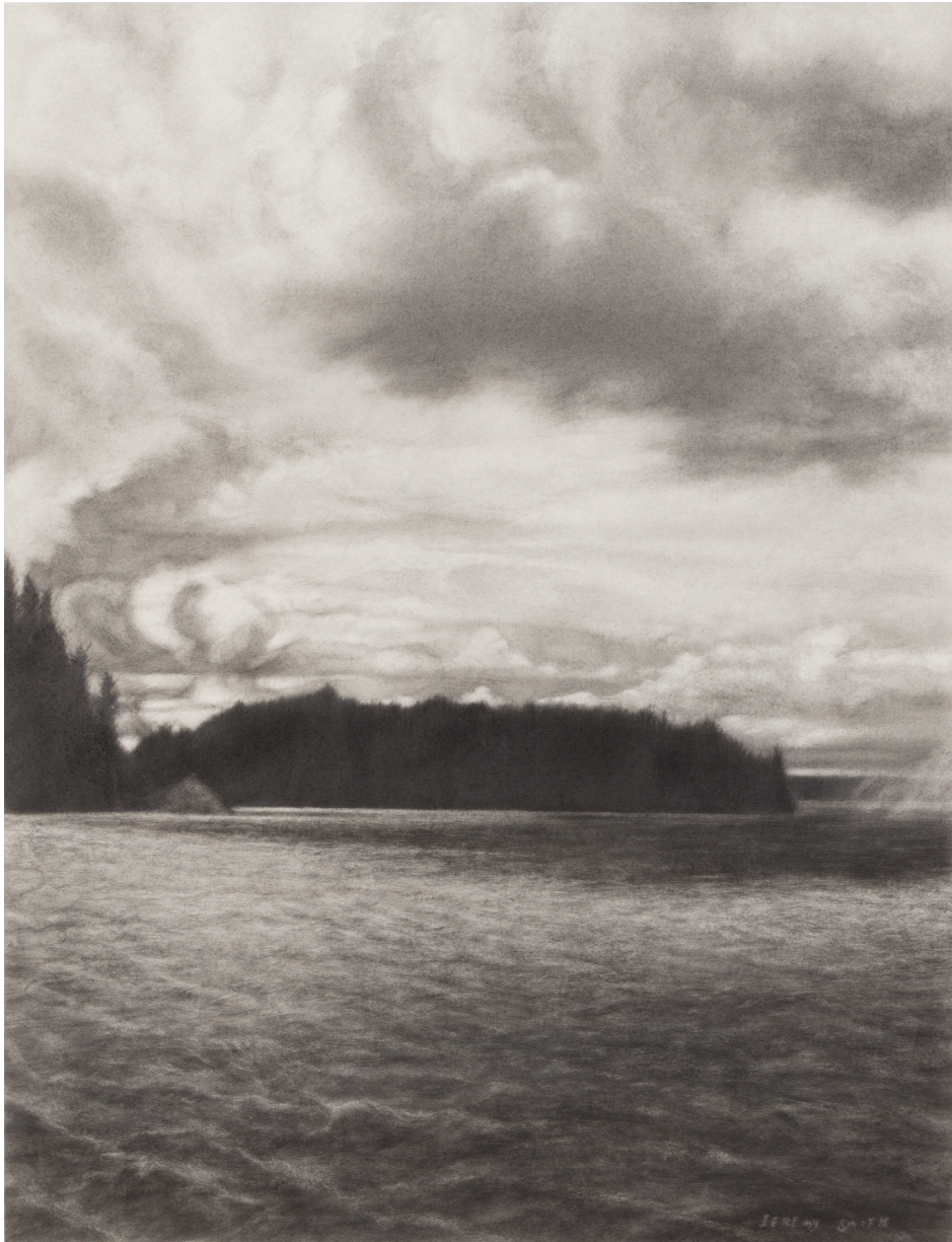
Clouds Over Mosquito Bay 2019 pencil on paper 24 1/4 x 18 5/8 inches